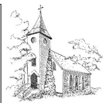
St. Mary of the Rosary, Hepworth Sunday 9:00 am (Nov-Mar)

Email: stmaryowensound@hamiltondiocese.com www.stmarysandthemissions.ca